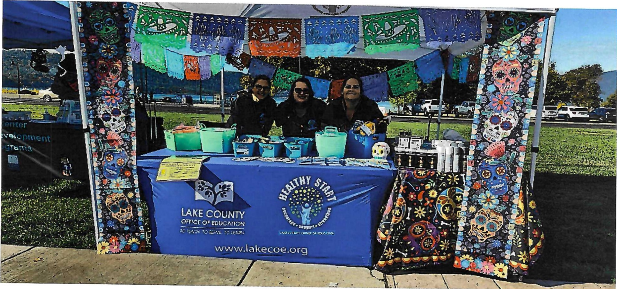
Tabling at Dia de Los Muertos at Austin Park