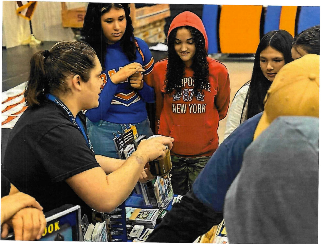
Obsidian Middle School students viewing the Anti Tobacco, Vape and Cannabis Models