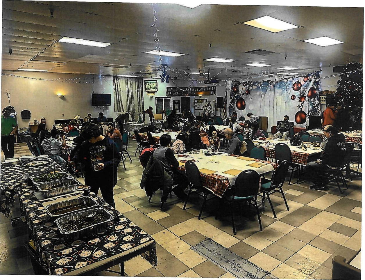
Foster Youth Christmas Luncheon at the Moose Lodge, catering by Foods Etc.