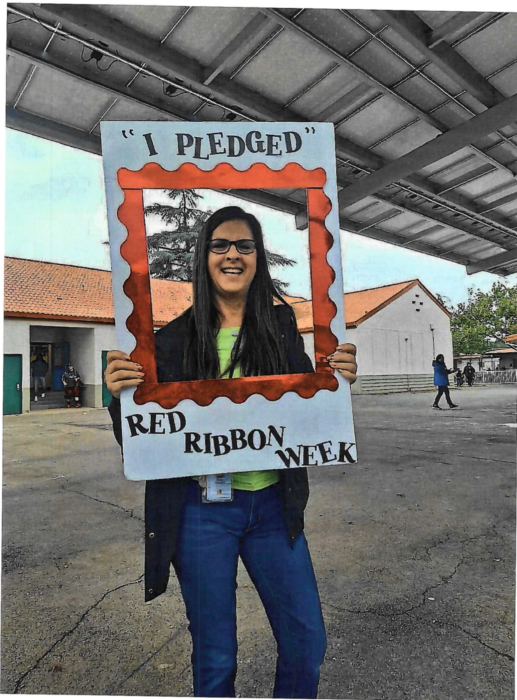
Red Ribbon Week at Burns Valley Elementary