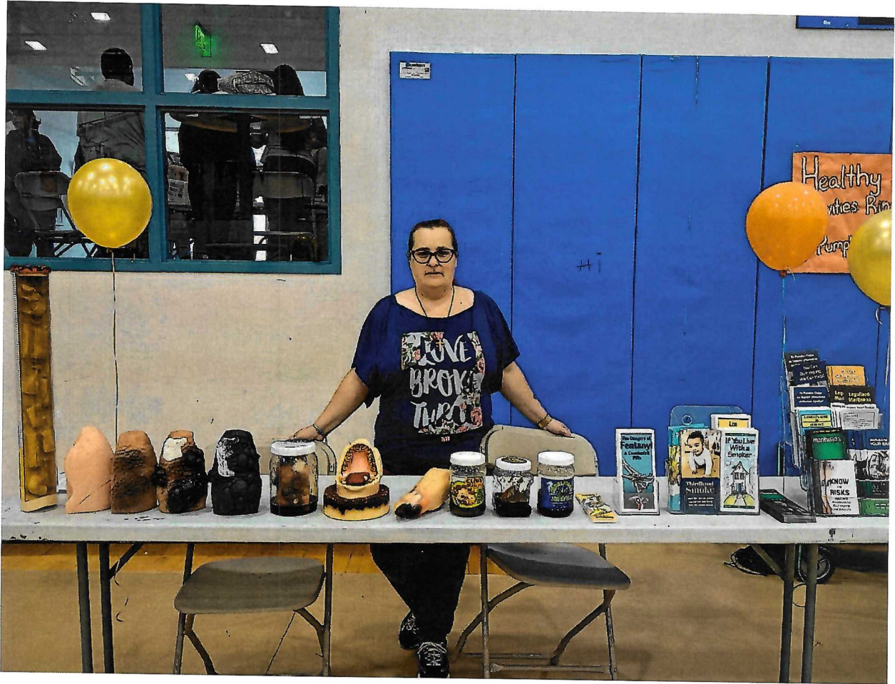
Lower Lake High School Tabling at the Fall Festival