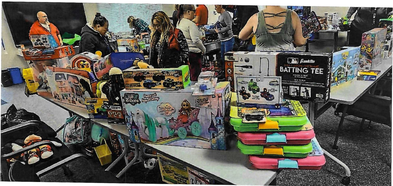
Christmas Presents for needy Families donated by Strong Financial